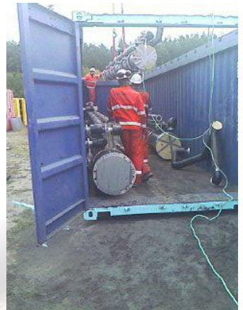
Unloading a 13 ton pre-insulated steel pipe in Norway

Therefore, Stenca Trading has developed its Stenca Pipe insulation to be able to resist high pressures which makes the material suitable for pre-insulation of pipes and vessels on land. To make this statement valid the Material has made a Load-Pressure Test. However, the real capacity test was made, when a pre-insulated pipe of 13 tons had to be removed from the container to its destination by crane with only two strings placed directly on the insulated pipe. This turned out with satisfaction due to the material did not get damaged or was had any defaults afterwards.